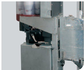
Cup dispenser with double hinge joint for complete articulation of the unit, facilitates access to the internal machine parts for all loading, maintenance and cleaning operations