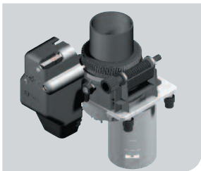
Flat blade professional grinder MF1