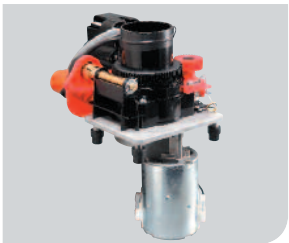
Available flat blade professional grinder MF2 with automatic grinding variation