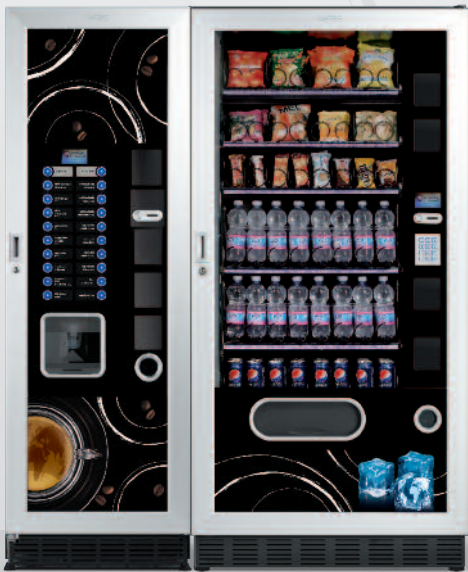
Winning GCD + Faster GCD 900